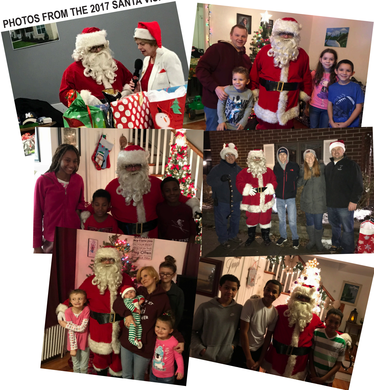
PHOTOS FROM THE 2017 SANTA VISITS

CHECK NEXT MONTH'S NEWSLETTER FOR THIS YEAR'S PHOTOS